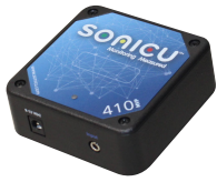
MVP 410 single port wireless meter