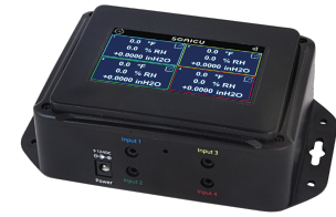
ARC 440 - meter with display available.