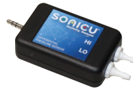
DPS Differential Air Pressure sensor Accuracy: +/- .25% Range: +/- 4 in H 2 O