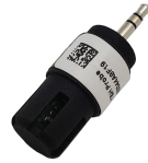
digital temperature and humidity sensor