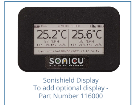
Sonishield Display To add optional display - Part Number 116000