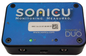
Sonishield Duo wireless meter