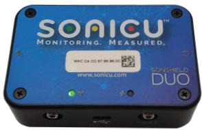
Sonishield Duo wireless meter