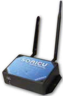
Gateway 5.1" x 3.57" x 1.573"